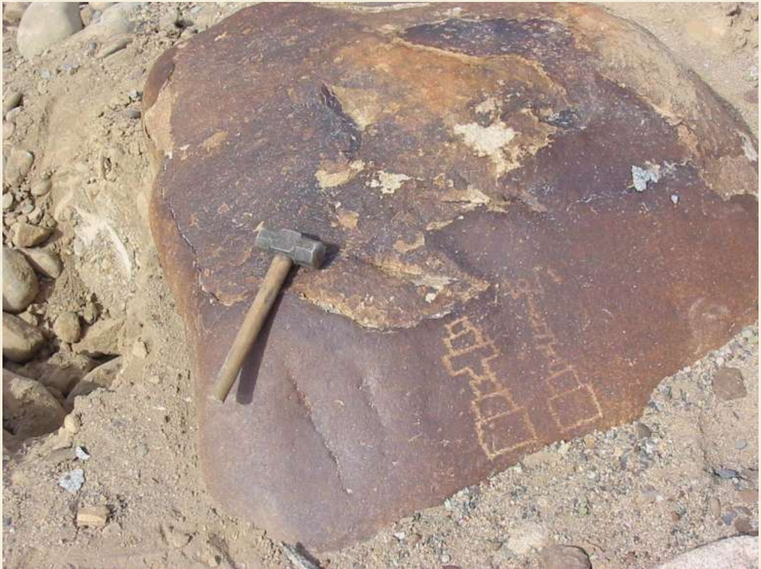
Fate of rock carvings...