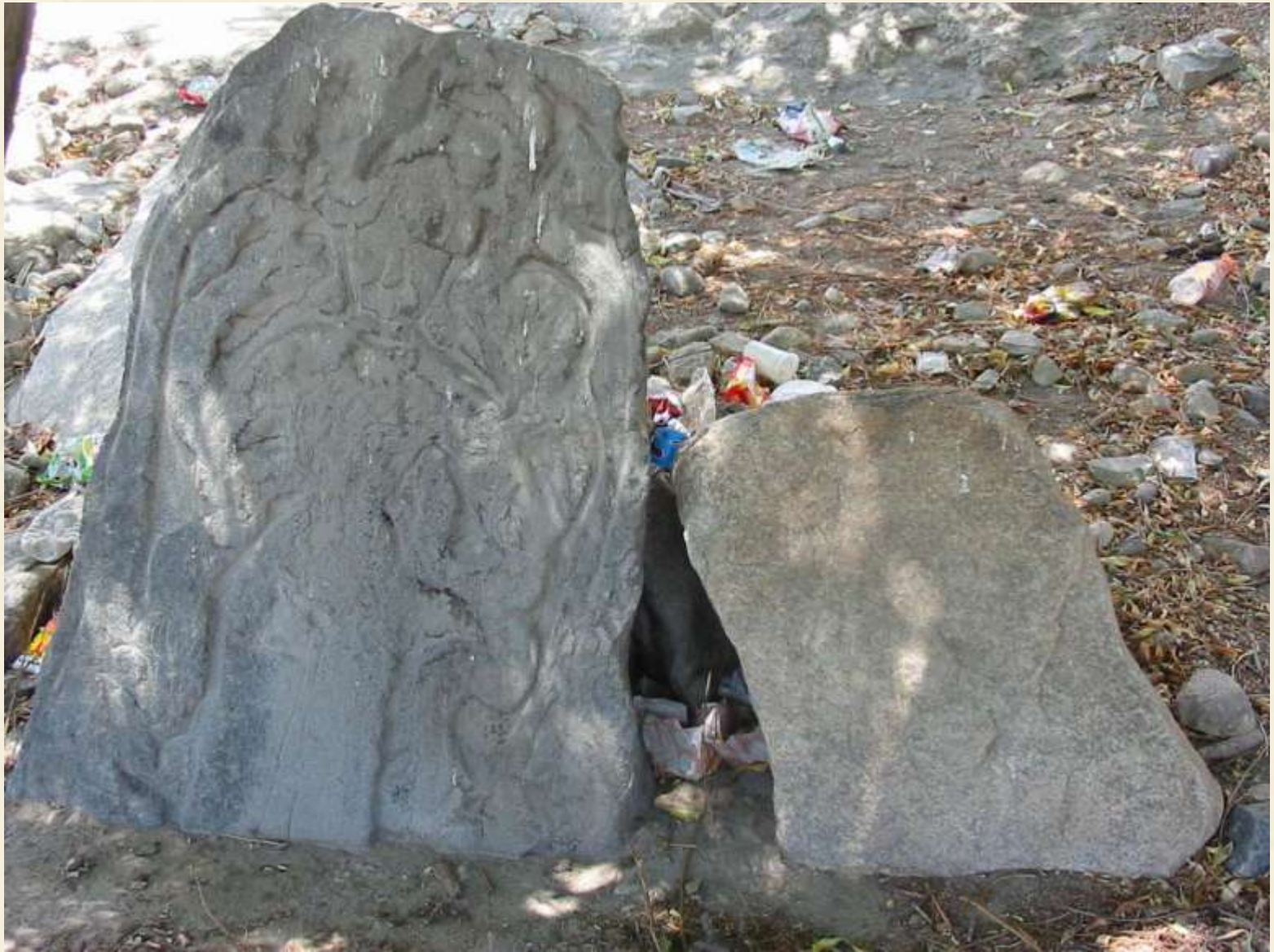
Early Buddhist carvings: also used as dump garbage