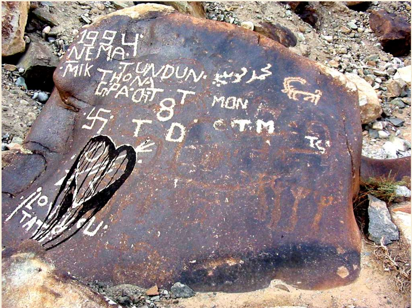
Rock art: the earliest historical heritage of Ladakh,