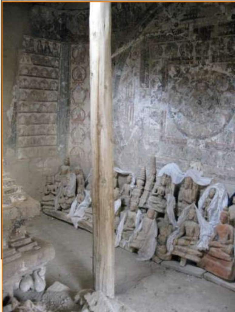
Murals threatened by water leakage...