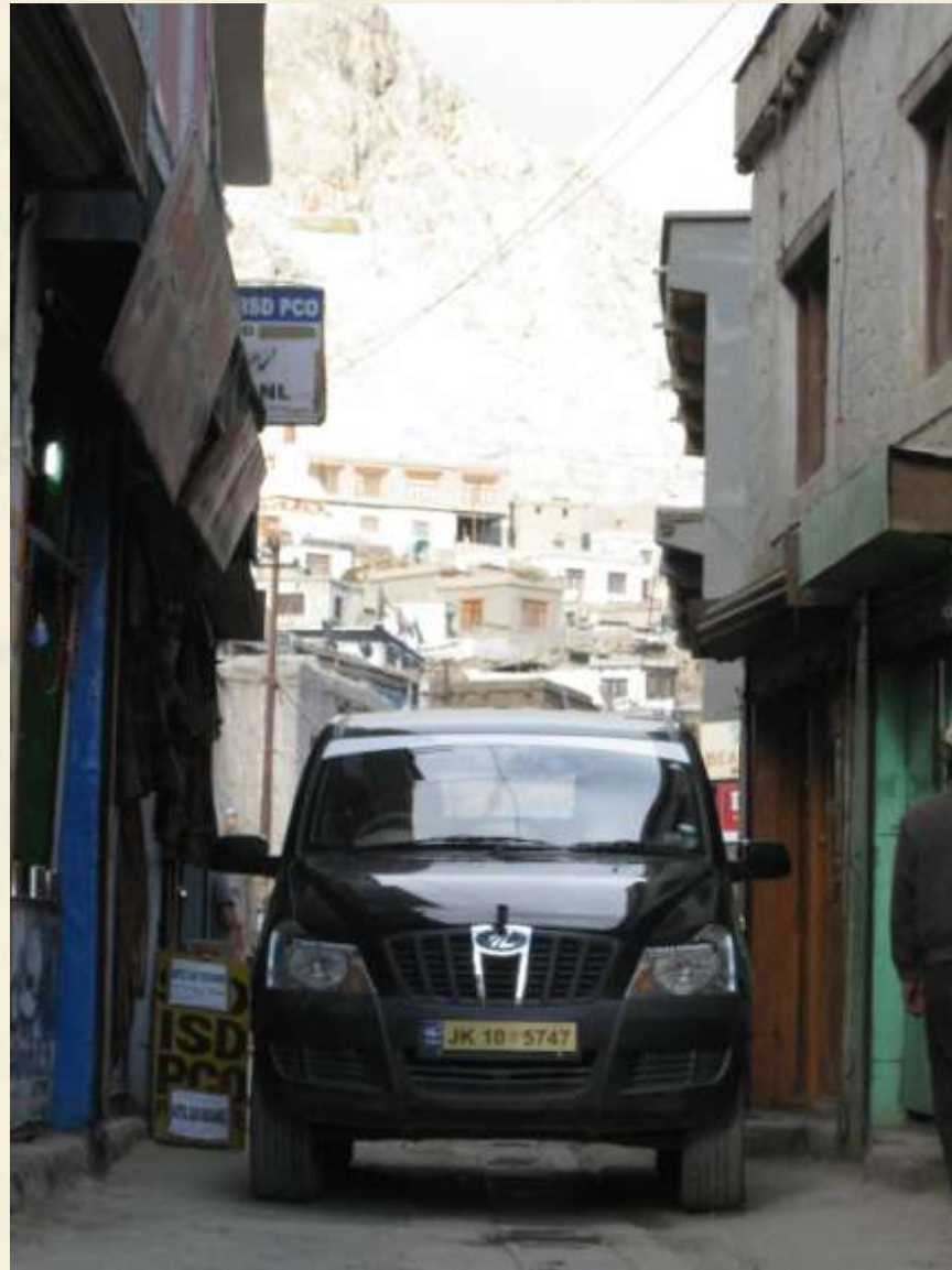
The Leh old town threatened by a new road...