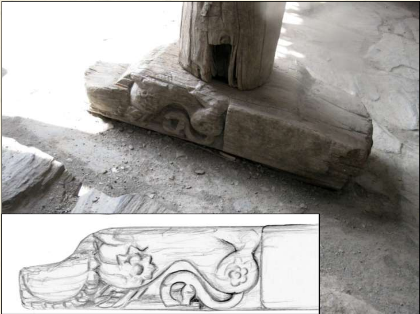
Eleventh century carved beam...